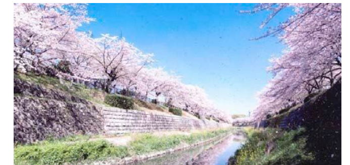
「さくら名所100選」にも選ばれた山崎川の桜 Yamazaki River cherry blossoms were selected among the Top 100 Cherry Blossom Spots

A town with old-fashioned manufacturing, and history, cultural, and sports facilities