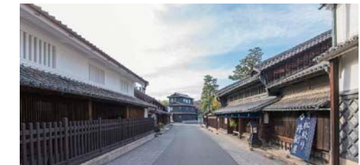
重要伝統的建造物群保存地区に選定された有松の町並み The Arimatsu townscape, selected as an Important Preservation District for Groups of Traditional Buildings

住みたいまち 訪れたいまち 緑区 Midori Ward, the neighborhood you want to visit and live in