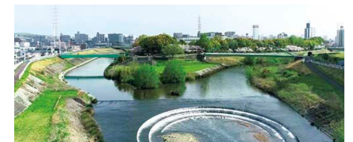
天白川と桶田川の合流点にある慶栄工 Construction designed for bed protection at the confluence of the Tempaku River and the Ueda River.

緑豊かな自然環境と快適な住環境が共存するまち A neighborhood with an abundant green natural environment and comfortable living environment