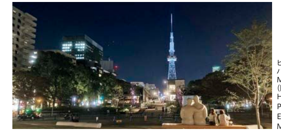
ヒサヤオドリパークと中部電力MIRAI TOWER(旧・名古屋テレビ塔) Hisaya-odori Park and Chubu Electric Power MIRAI TOWER

名古屋のシンボルである名古屋城や、全国でも有数の大規模な官庁街を有し、またさまざまなオフィスやホテル、商業娯楽施設や文化施設などが多数集まり、絶えずにぎわいを見せています。商業、文化、行政などの都市機能の高度集積が図られるとともに、名古屋城下町の歴史や文化が薫るまちとして発展を続けています。