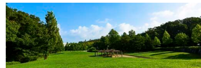
牧野ヶ池緑地 Makinogaikie Ryokuchi Park

郊外のゆとりと都市機能を併せ持った、魅力と活気が混在するまち A neighborhood with appeal and vitality, with suburban relaxation and urban functions