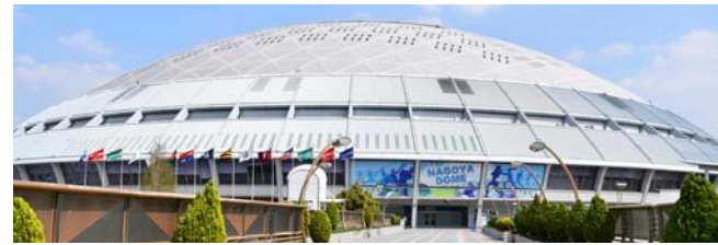
バンテリンドーム ナゴヤ VANTELIN DOME NAGOYA

A neighborhood shining with people, culture, and history