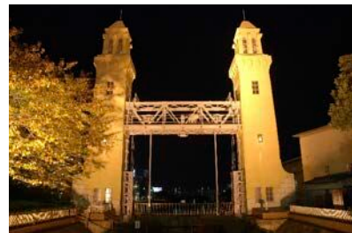
ヨーロッパの城塔を思わせる4つの塔が優美な松重開門 The four elegant towers of Matsushige Koman are reminiscent of European castle towers

川と歴史を人がつなぐまち A neighborhood where people connect with the river and history