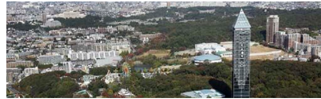
東山動物園(スカイタワー)と広がる住宅街 Higashiyama Zoo and Botanical Gardens (Sky Tower) and residential area

A neighborhood with liveliness, relaxation, history, and a comfortable living environment "Good Balance" Chikusa