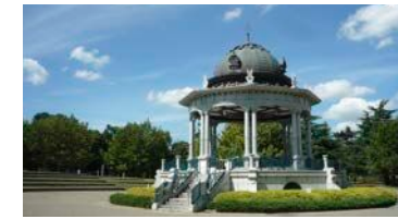
鶴舞公園の代表的な建造物 奏楽堂 Sogakudo, a major Tsuruma Park building 鶴舞公園は、1909年に名古屋市が設置した公園の第一号です。噴水塔と奏楽堂に象徴される庭園を中心にサクラ・バラ・ハナショウブなど、四季折々の花が楽しめます。 Tsuruma Park is the first park opened by Nagoya in 1909. Centered on a garden with fountain and concert hall. Cherry blossoms, roses, irises, and other seasonal flowers on display.

A neighborhood in the center of Nagoya where culture and daily life blend, and young people gather in a global atmosphere