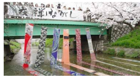
毎年春に開催される「黒川友禅流し」 "Kurokawa Yuzen-nagashi" held every spring

A neighborhood abundant in water and greenery where the tradition still lives on