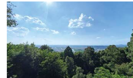
東谷山の展望台から見た景色 View from the observation deck of Mt. Togoku

人と自然の調和する 元気あふれるまち守山 Moriyama, a vibrant neighborhood where people live in harmony with the natural environment