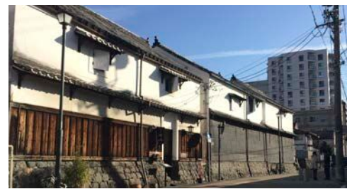
蔵が並ぶ四間道の町並み (名古屋市町並み保存地区) Shikemichi townscape with warehouses (Nagoya Townscape Preservation Zone)

A town with two sides: traditional castle town and transportation hub