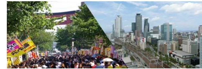
The History & Evolution

A neighborhood with urban vitality and Sengoku warlord history