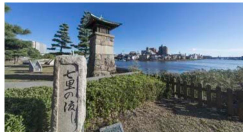
「時の鐘」「常夜燈」が復元された宮の渡し公園 Miya-no-Watashi Park with restored "Bell of Time" and "Night Light Tower"

君を待つまち 熱田 ATSUTA, The True Heart of Japan