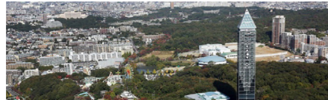
東山動植物園(スカイタワー)と広がる住宅街 Higashiyama Zoo and Botanical Gardens (Sky Tower) and residential area

A neighborhood with liveliness, relaxation, history, and a comfortable living environment "Good Balance" Chikusa