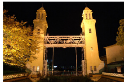
ヨーロッパの城塔を思わせる4つの塔が 優美な松重開門 The four elegant towers of Matsushige Koman are reminiscent of European castle towers

川と歴史を人がつなぐまち A neighborhood where people connect with the river and history