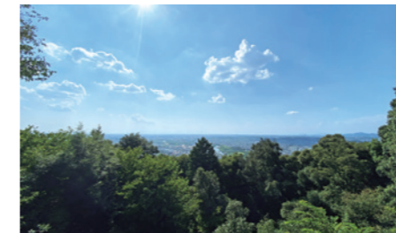
東谷山の展望台から見た景色 View from the observation deck of Mt. Togoku

人と自然の調和する 元気あふれるまち守山 Moriyama, a vibrant neighborhood where people live in harmony with the natural environment