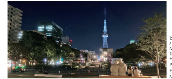
ヒサヤオドリパークと中部電力MIRAI TOWER(旧・名古屋テレビ塔) Hisaya-odori Park and Chubu Electric Power MIRAI TOWER

名古屋のシンボルである名古屋城や、全国でも有数の大規模な官庁街を有し、またさまざまなオフィスやホテル、商業娯楽施設や文化施設などが多数集まり、絶えずにぎわいを見せています。商業、文化、行政などの都市機能の高度集積が図られるとともに、名古屋城下町の歴史や文化が薫るまちとして発展を続けています。