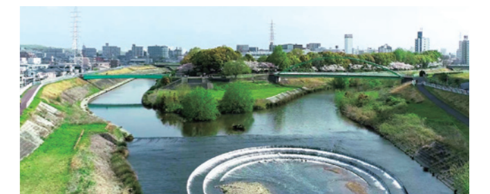
天白川と桶田川の合流点にある慶床工 Construction designed for bed protection at the confluence of the Tempaku River and the Ueda River.

緑豊かな自然環境と快適な住環境が共存するまち A neighborhood with an abundant green natural environment and comfortable living environment