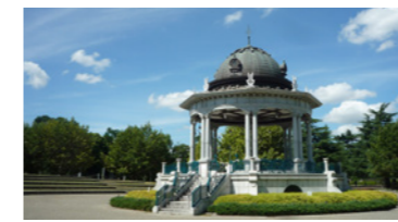
鶴舞公園の代表的な建造物 奏楽堂 Sogakudo, a major Tsuruma Park building 鶴舞公園は、1909年に名古屋市が設置した公園の第一号です。噴水塔と奏楽堂に象徴される庭園を中心にサクラ・バラ・ハナショウブなど、四季折々の花が楽しめます。

A neighborhood in the center of Nagoya where culture and daily life blend, and young people gather in a global atmosphere