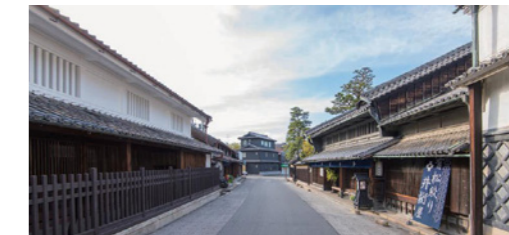
重要伝統的建造物群 保存地区に選定された 有松の町並み The Arimatsu townscape, selected as an Important Preservation District for Groups of Traditional Buildings

住みたいまち 訪れたいまち 緑区 Midori Ward, the neighborhood you want to visit and live in