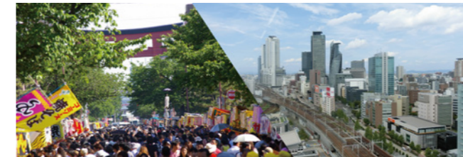
The History & Evolution

A neighborhood with urban vitality and Sengoku warlord history