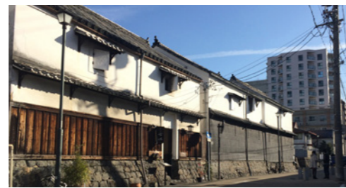
蔵が並ぶ四間道の町並み (名古屋市町並み保存地区) Shikemichi townscape with warehouses (Nagoya Townscape Preservation Zone)

A town with two sides: traditional castle town and transportation hub