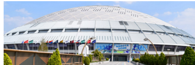
バンテリンドーム ナゴヤ VANTELIN DOME NAGOYA

A neighborhood shining with people, culture, and history