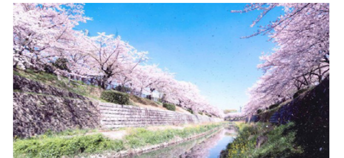
「さくら名所100選」にも選ばれた山崎川の桜 Yamazaki River cherry blossoms were selected among the Top 100 Cherry Blossom Spots

A town with old-fashioned manufacturing, and history, cultural, and sports facilities