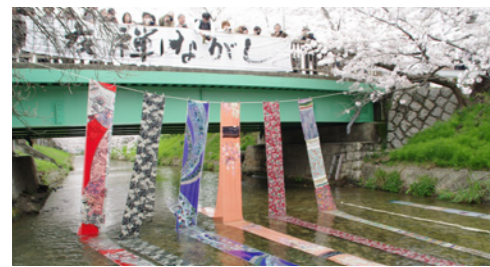
毎年春に開催される「黒川友禅流し」 "Kurokawa Yuzen-nagashi" held every spring

A neighborhood abundant in water and greenery where the tradition still lives on