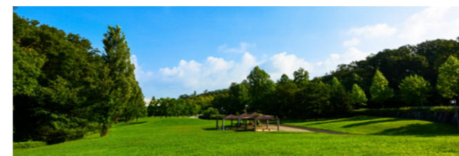
牧野ヶ池緑地 Makinogaikie Ryokuchi Park

A neighborhood with appeal and vitality, with suburban relaxation and urban functions